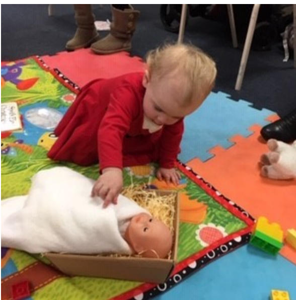
Staying with Christmas, these two delightful photos were taken at the Storytime Café Christmas Party.