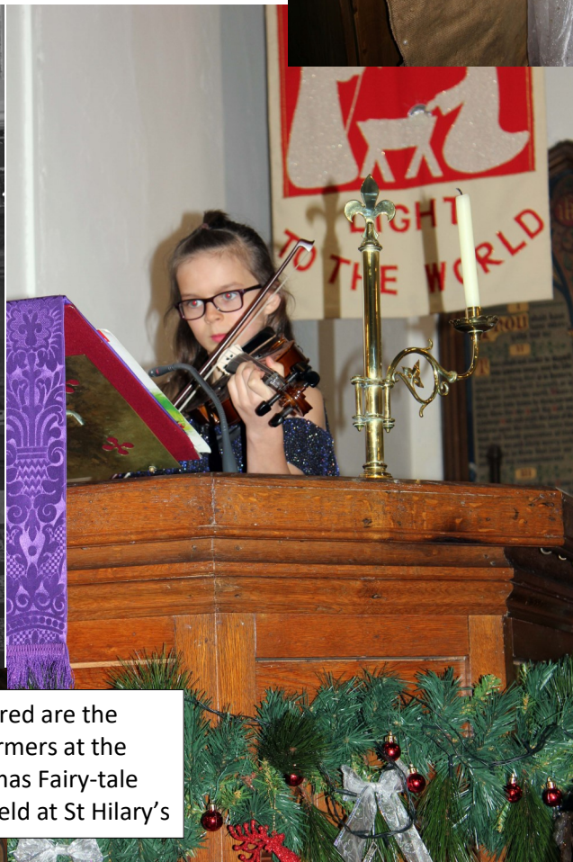
Pictured are the performers at the Christmas Fairy-tale Concert held at St Hilary's